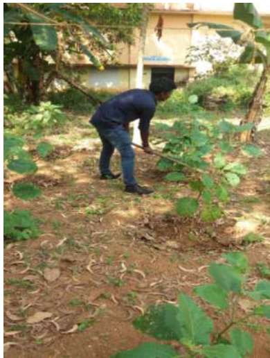
Removal of weeds in the vegetable Garden

During the Christmas vacation, selected NSS volunteers undertook the watering, removal of weeds and applying of organic manure in the organic vegetable garden in the college.