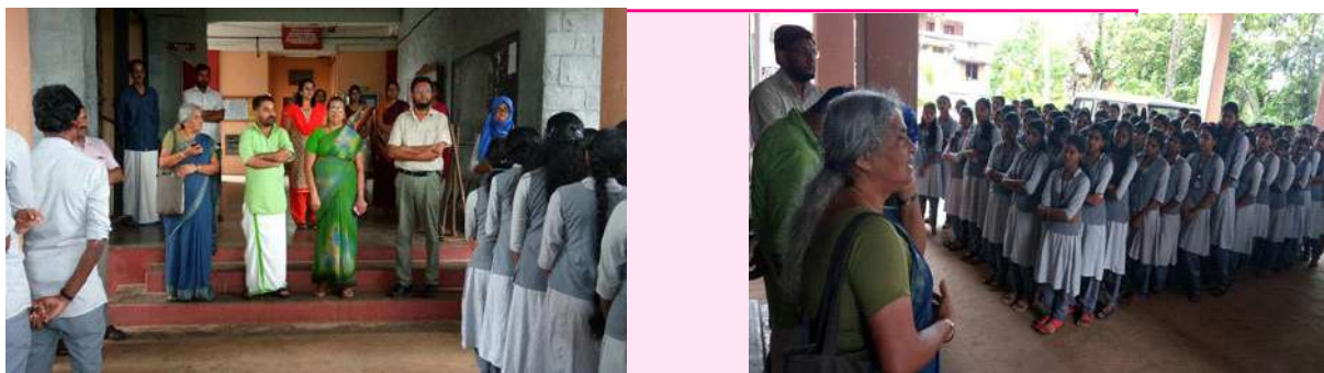
05 June 2017 World Environment Day programme

World Environment Day was observed by the NSS Unit. In the meeting organised in this connection the volunteers took solemn pledge to work towards preserving the ecology by resorting to organic methods and doing away with the plastic as much as possible. They planted tree saplings with a view to increasing the green cover in the campus