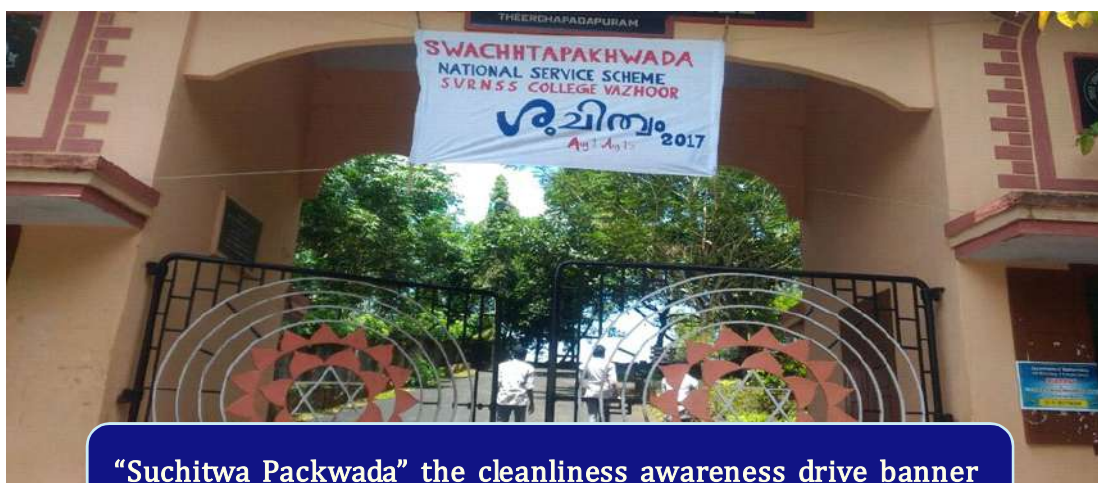
“Suchitwa Packwada” the cleanliness awareness drive banner

The NSS Unit observed Suchitwa Packwada- the cleanliness awareness drive of the Central Government with keen enthusiasm during this fortnightly period with full of energy and enthusiasm. The volunteers took oath to make cleanliness a habit. They also cleaned the college campus regularly during the period and made it neat and attractive.