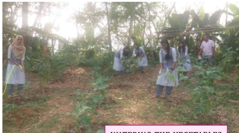
WATERING THE VEGETABLES

The volunteers harvested vegetables from the organic garden and handed over to the College canteen in the presence of the Programme Officers.