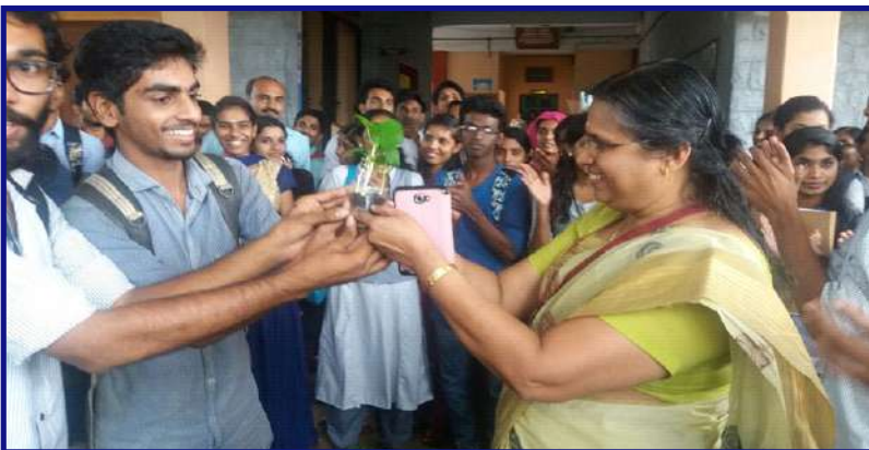
The College level seed distribution ceremony of Jaivam 2017