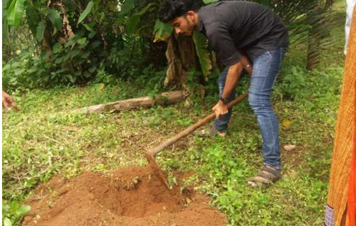
PLANTATION OF BANANA PLANTS

The volunteers undertook plantation of banana plants in the college compound. They readied the allotted area and dug pits and planted around 15 banana saplings.