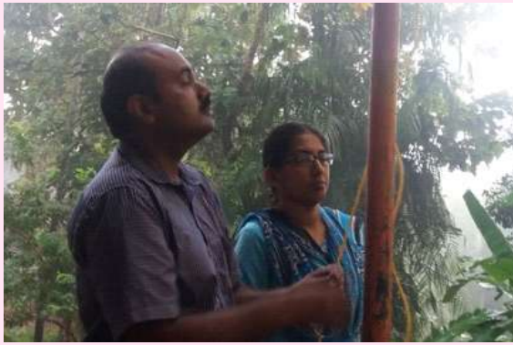
FLAG HOIST BY PROGRAMME OFFICER