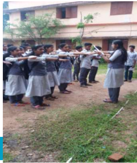
National Integration Pledge.

As per the directive of the Government, 31 st October, the death anniversary of Smt. Indira Gandhi was observed as National Re-dedication day. Accordingly the NSS volunteers and Programme Officers assembled and observed two – minutes silence from 10:15 a.m to 10:17 am followed by taking the National Integration Pledge. The National Anthem was then sung. In the evening all the volunteers and the NSS Programme officers assembled and took the Rashtriya Ekta Diwas pledge in commemoration of the contributions of Sardar Vallabhai Patel