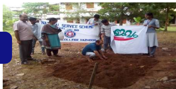
The college level launching of Jaivam -2017