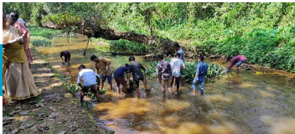
NSS volunteers cleaning Valiyathodu

LETTER OF APPRECIATION FROM LOCAL SELF GOVERNMENT INSTITUTION