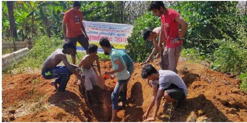
Digging the compost pit for school students

As part of community service in the neighbourhood, NSS volunteers dug pit for compost unit in the premises of SVRV NSS highschool for its effective solid waste management. 20 volunteers engaged in this programme.