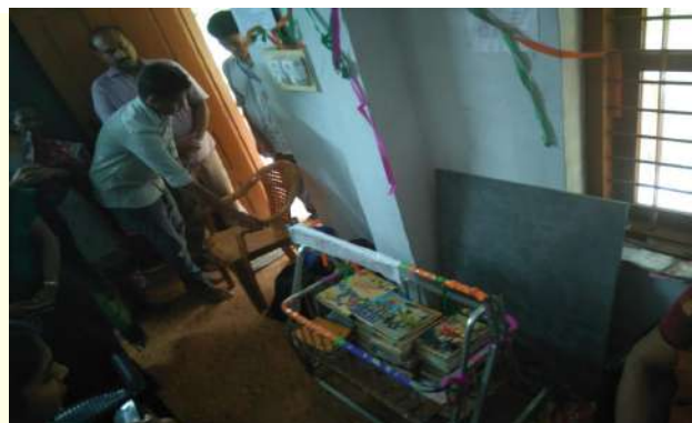
Donating books to Pakalveedu library