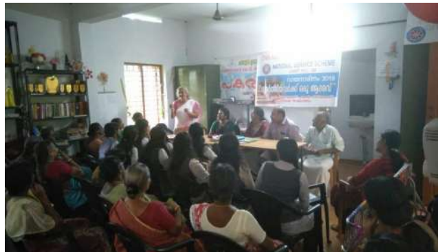
Honouring the aged Parents