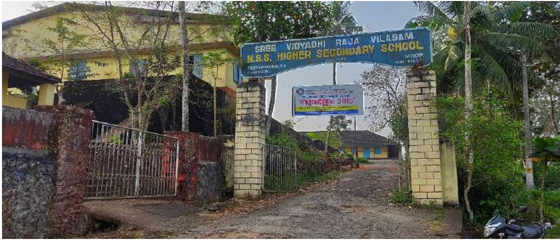
Sree Vidyadhi Raja Vilasam N.S.S. Higher Secondary School, Theerthapadapuram P.O., Vazhoor