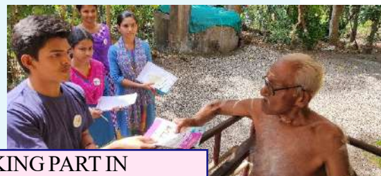
VOLUNTEERS TAKING PART IN THE SURVEY, CLEANLINESS