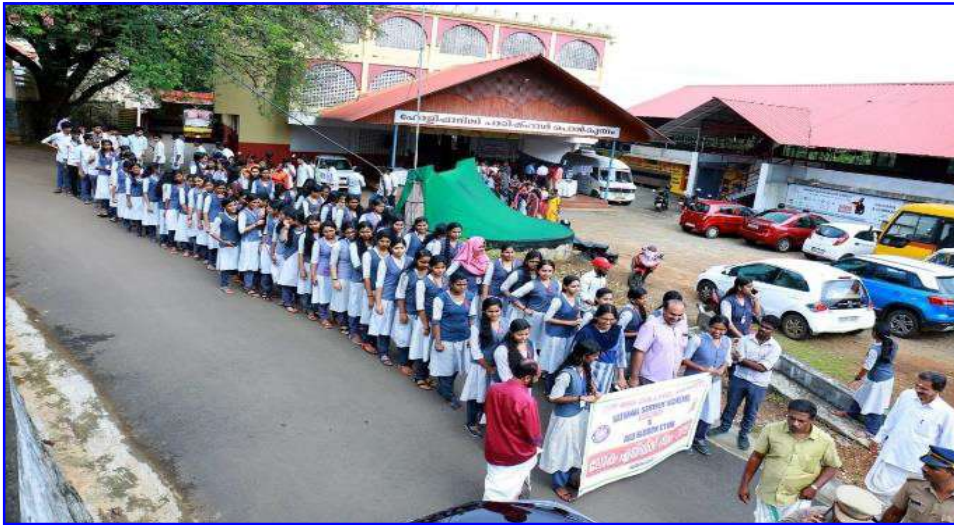
Volunteers participating in the rally and public function held at Ponkunnam as part of World AIDS Day awareness on 01-12-2019

The NSS volunteers carried out the distribution of saplings supplied by the Panchayath to 100 households to the beneficiaries of Haritha samridhi programme on 16-11-2019 at Pakalveedu. 100 volunteers participated in this programme.