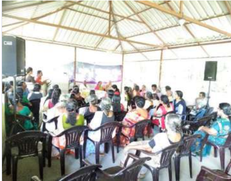
International Day of Older Persons being observed . in a function organised by the Vazhoor Grama Panchayath at “Pakal veedu”- the library cum get together place for old people instituted by the Vazhoor Grama Panchayath. 15 NSS Volunteers and programme officers participated. They entertained the aged gathering by various cultural activities on 01.10.2019

International Day of Older Persons was observed. 15 NSS Volunteers and programme officers visited “Pakalveedu”- the library cum day care center for old people instituted by the Vazhoor Grama Panchayath , and entertained the aged gathering by various cultural activities.